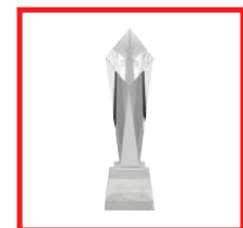
"Best Securities Company" Capital Magazine (2011, 2012)