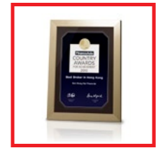
"Best Broker Hong Kong" FinanceAsia (2007-2010)

* SHK Online (Securities) Limited, Sun Hung Kai Commodities Limited, Sun Hung Kai Forex Limited, SHK Fund Management Limited, Sun Hung Kai International Limited, Sun Hung Kai Investment Services Limited and Sun Hung Kai Wealth Management Limited.