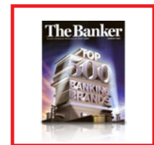
"Top 500 Banking Brands" The Banker (2008)