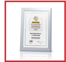
"Best Equity House Hong Kong" FinanceAsia (2009)