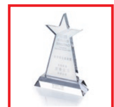
"Excellent Services Brand Award" Sing Tao Daily (2007, 2008, 2011)